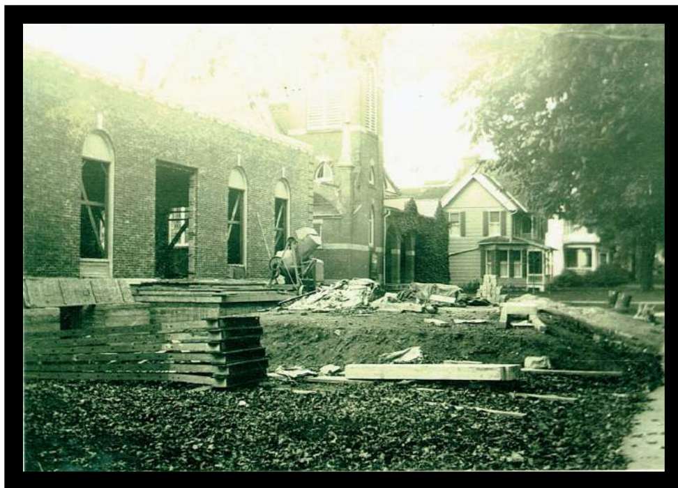
Construction of the Barber Memorial Building at 143 Genesee Street, 1927